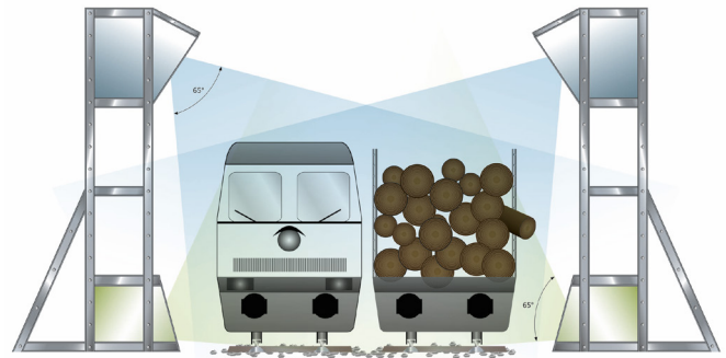
Left: The 3D image is available immediately after the train has passed and can be analyzed for geometrical irregularities. Right: Four scanners measure the geometry of passing trains.

at 800 profiles per second to address the requirements of freight trains and moderate speed passenger lines. The High Profile Density HPD setup is designed for use on high speed lines. It features 900 data points per profile with 3,200 profiles per second, which results in a density of 32 profiles per meter at 360 km/h.